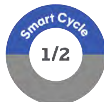
Pre-Transfer Embryology Services