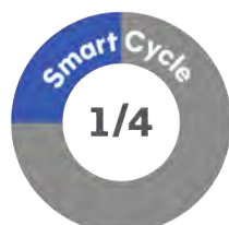
Timed Intercourse (TIC)