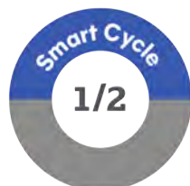
Frozen Oocyte Transfer (FOT)