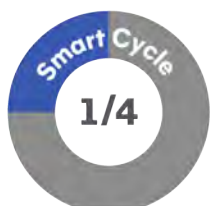
Intrauterine Insemination (IUI)