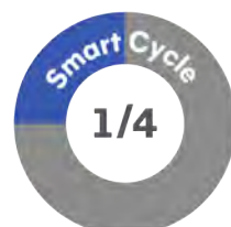
Split Cycle (Egg & Embryo Freezing) When paired with IVF cycle