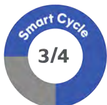
IVF Fresh Cycle

Visit the Explanation of Covered Treatments & Services section of the Member Guide to learn more. For a full explanation of what's covered under each Smart Cycle, visit the Understanding Your Coverage section.