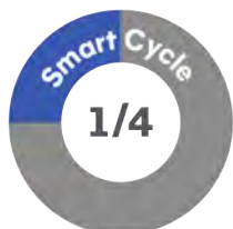
Frozen Embryo Transfer (FET)