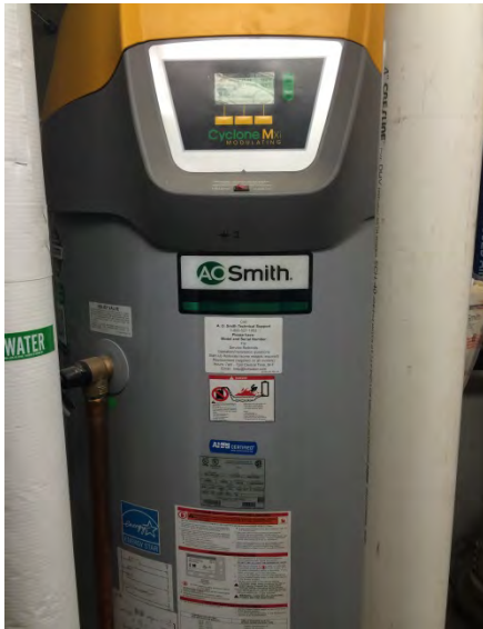
AO Smith Water Heater #1 Shut Down Process Energy Source(s) Electric – Gas

St Cloud Public Schools – South School – Boiler room