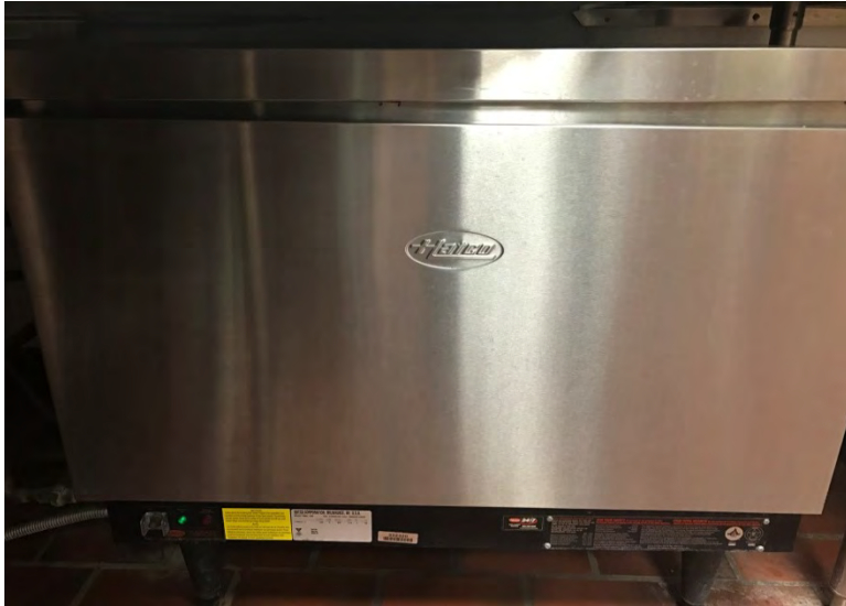
Hatco Booster Heater Shut Down Process Energy Source(s) Electric – Gas

St Cloud Public Schools – South School – Kitchen