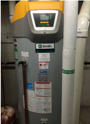
AO Smith Water Heater #2 Shut Down Process Energy Source(s) Electric – Gas

St Cloud Public Schools – South School – Boiler room