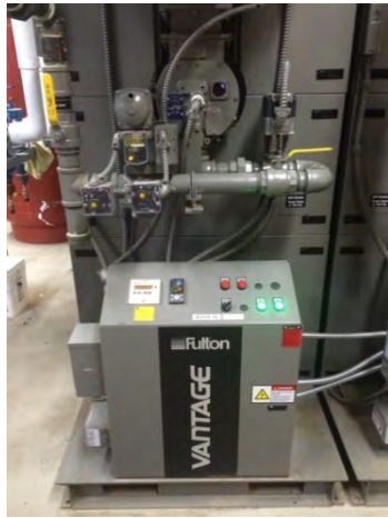
Fulton Boiler #1 Shut Down Process Energy Source(s) Electric, Hot H2O, Gas

St Cloud Public Schools – South School – Boiler room