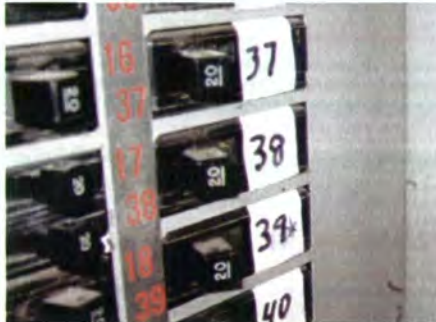
Isolating Device Location 1