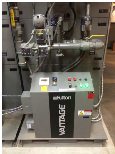
Fulton Boiler #2 Shut Down Process Energy Source(s) Electric, Hot H2O, Gas