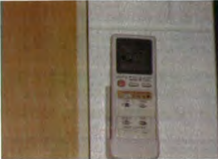
Operating Control Location