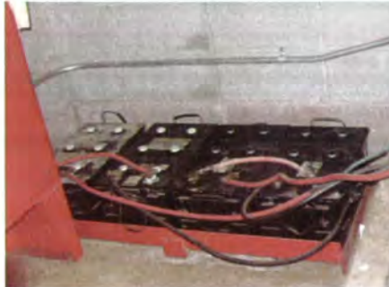
Isolating Device Location 1