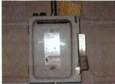
Isolating Device Location 1