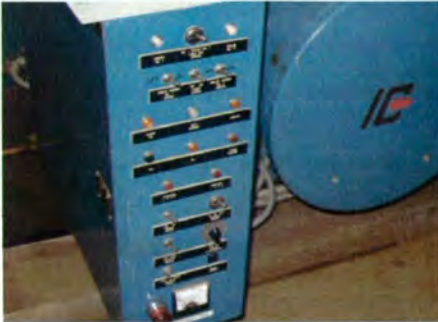
Operating Control Location