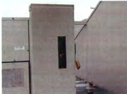
Isolating Device Location 1