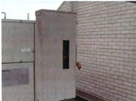
Isolating Device Location 1