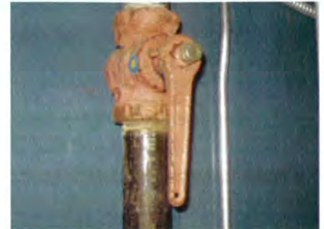
Isolating Device Location 2

Ball valve on natural gas pipeline supplying unit