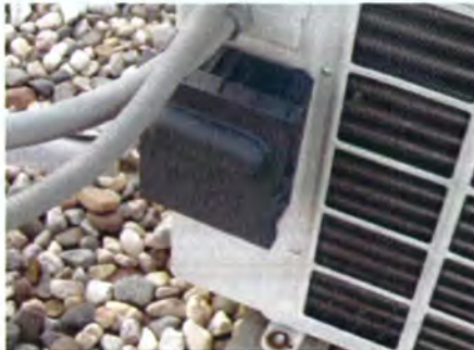
Isolating Device Location 1