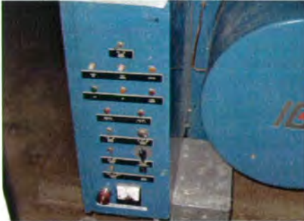
Operating Control Location