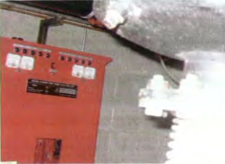
Operating Control Location