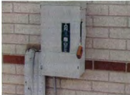
Isolating Device Location 1