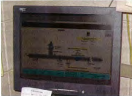
Operating Control Location