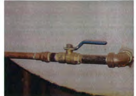
Isolating Device Location 2

Ball valve on diesel pipeline supplying unit