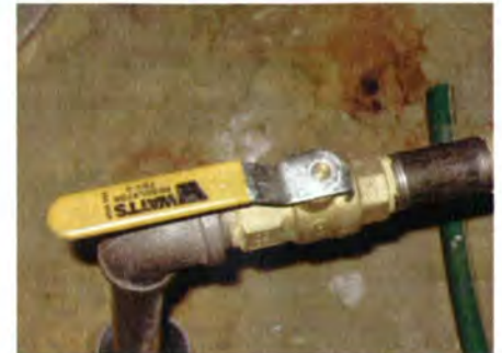
Isolating Device Location 2

Toggle switch next to unit labeled water heater