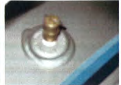
Isolating Device Location 3