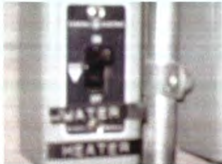
Isolating Device Location 1

Toggle switch next to unit labeled water heater