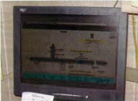
Operating Control Location