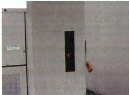
Isolating Device Location 1