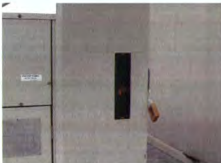
Isolating Device Location 1