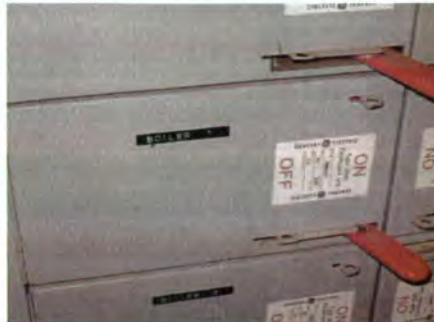
Isolating Device Location 1