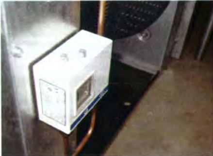
Operating Control Location