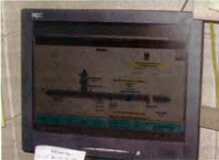
Operating Control Location