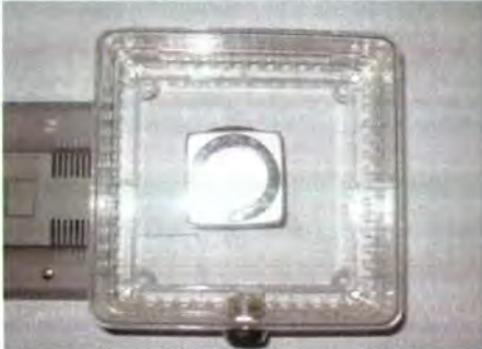
Operating Control Location