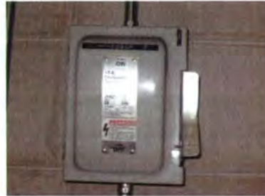
Isolating Device Location 2