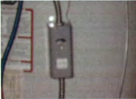
Operating Control Location