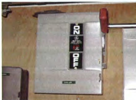
Isolating Device Location 1