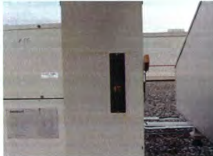
Isolating Device Location 1