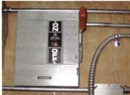
Isolating Device Location 1