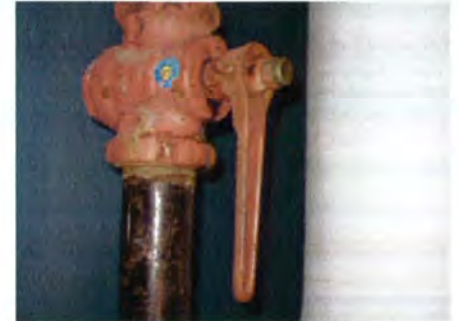
Isolating Device Location 2

Ball valve on natural gas pipeline supplying unit