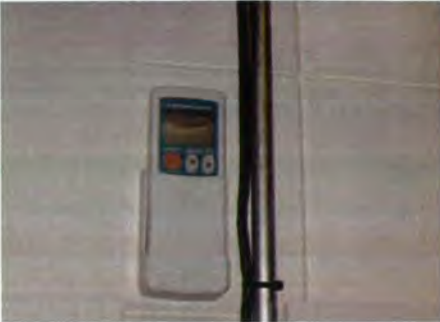
Operating Control Location