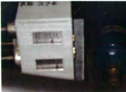
Operating Control Location