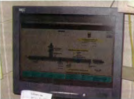
Operating Control Location