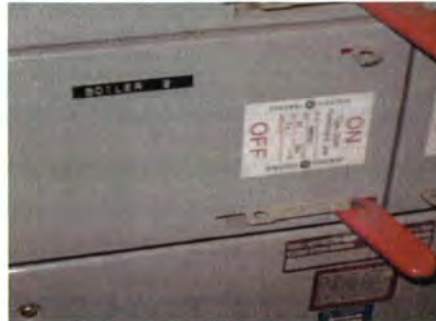
Isolating Device Location 1