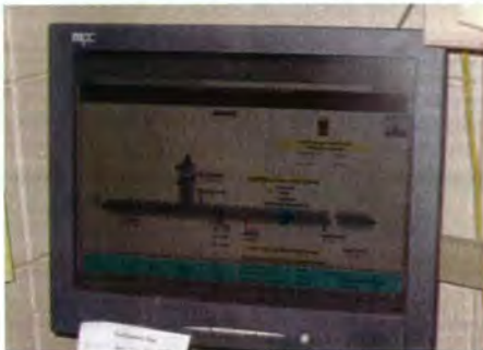
Operating Control Location