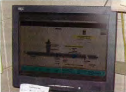
Operating Control Location