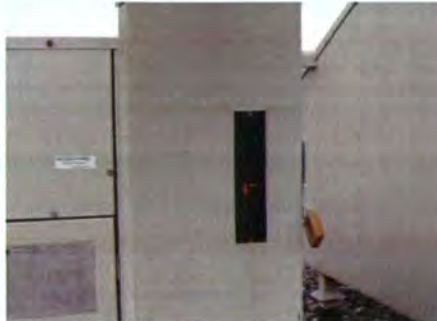
Isolating Device Location 1